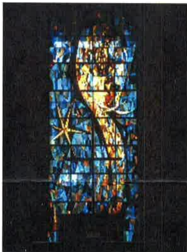
The stain glass in the front of Bethlehem's sanctuary.

I currently help with worship on Sundays and at our Thursday night services which serve as an outreach to the homeless population in our area. In addition, I teach 7 th and 8 th grade religion, assist with school chapel, and am helping with some of our small groups and new member education courses. I love my co-workers; they are all so talented and so helpful. Their presence and encouragement really push me to grow.