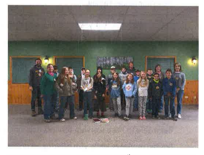
Here I am at our retreat with the 6<sup>th</sup> graders. The camp is called IdRaHaJe, which is abbreviated for "I'd Rather Have Jesus." It was a neat reminder that Jesus is worth so much more than anything this world offers!