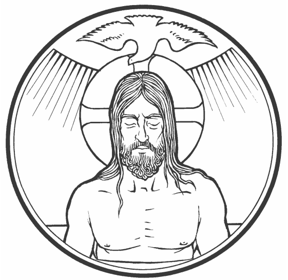
"...the Holy Spirit descended on him in bodily form, like a dove; and a voice came from heaven, 'You are my beloved Son; with you I am well pleased."" Luke 3:33

45 W Broadway Plainview, MN 55964 507-534-3700 (church) | 507-534-2108 (school) office@immanuelplainview.org www.ImmanuelPlainview.org school.ImmanuelPlainview.org facebook.com/ImmanuelPlainview