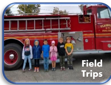
Praising God in all we do!